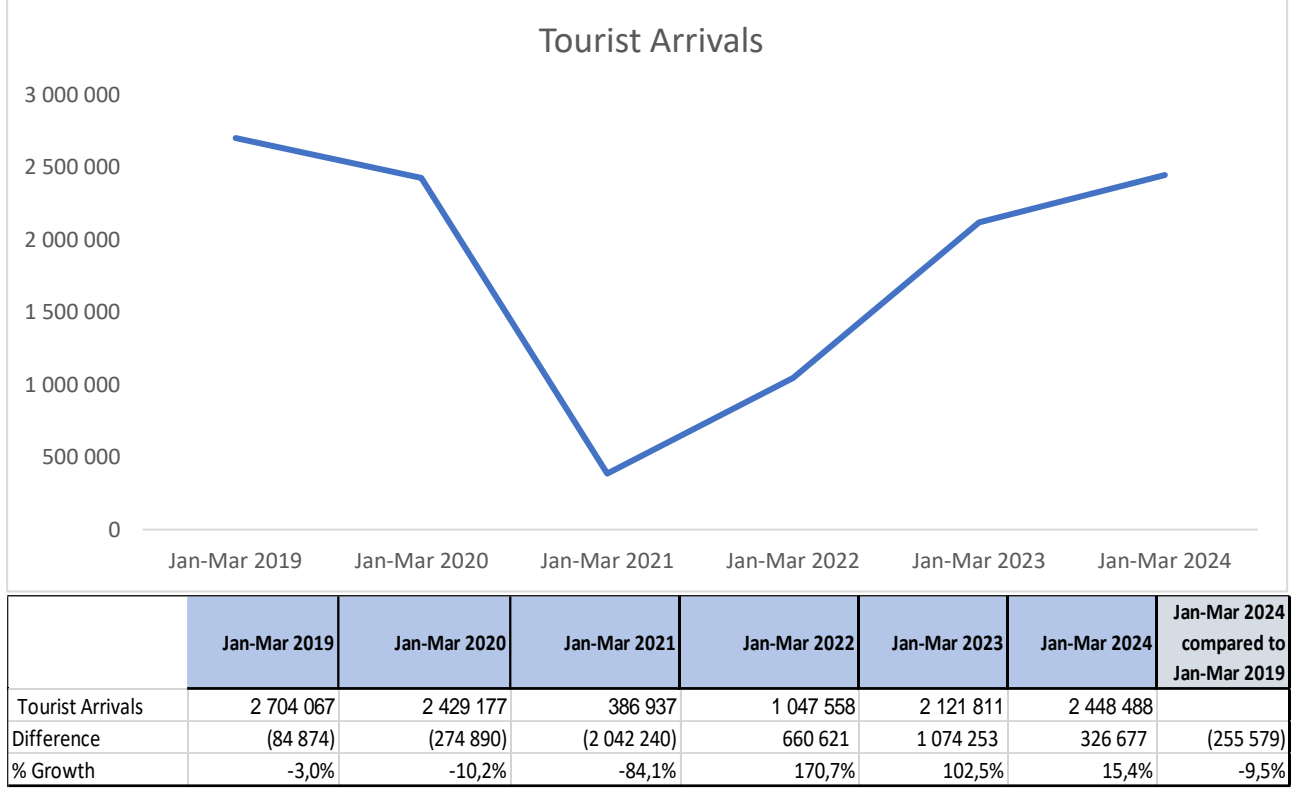
Figure 2: Total Tourist Arrivals January-March 2019 to January-March 2024